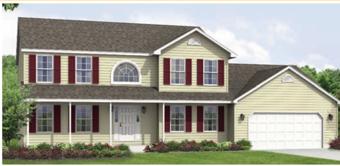
CLASSIC ELEVATION included