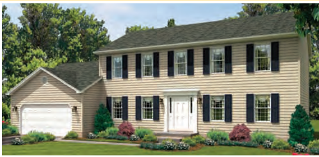
CLASSIC ELEVATION included