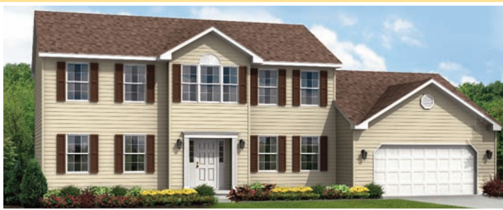
CLASSIC ELEVATION included