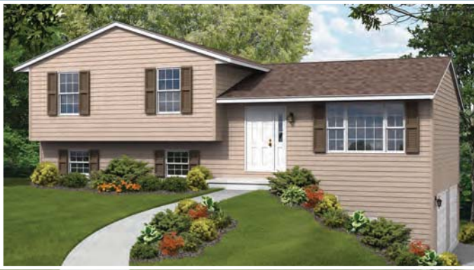
CLASSIC ELEVATION included