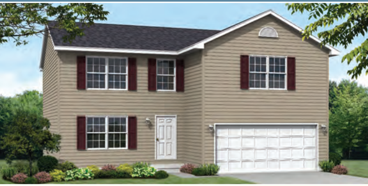
CLASSIC ELEVATION included