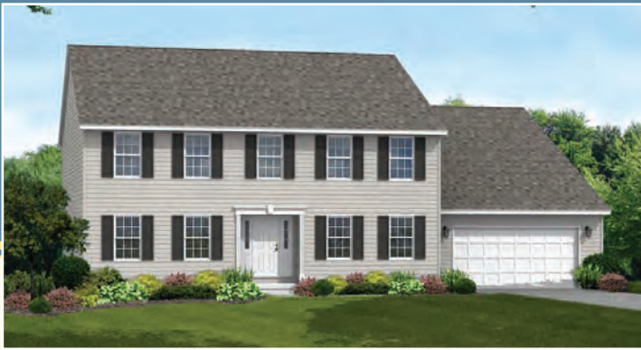
CLASSIC ELEVATION included