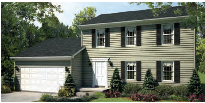
CLASSIC ELEVATION included

1,706 Square Feet 3 Bedroom | 2½ Bath | 2-Story